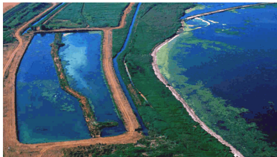
Figure 3: Phytotreatment pond

management activity in the lagoon. This consisted essentially of pumping water from two sea-lagoon canals into the lagoon, and allowing it to exit through the third canal. After the establishment of OLERA, the pumping was boosted from 8000 l s -1 to 20,000 l s -1 . The pumping is concentrated in the warmer months.