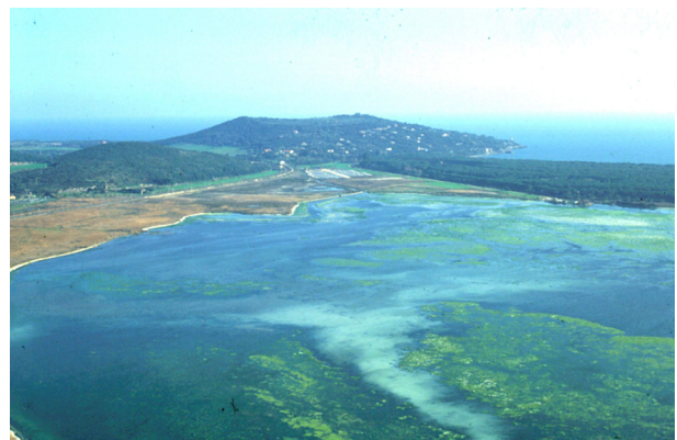
Figure 2: View of Orbetello Lagoon

For these reasons a basin Authority (Orbetello Lagoon Environmental Reclamation Authority, OLERA) was set up to implement action strategies that could solve the environmental crisis. The OLERA acted in three main ways: removal of the macroalgal masses from the lagoon; increasing the inputs of clean sea water in the lagoon; reduction of nutrients of anthropic origin (Lenzi & Mattei, 1998).