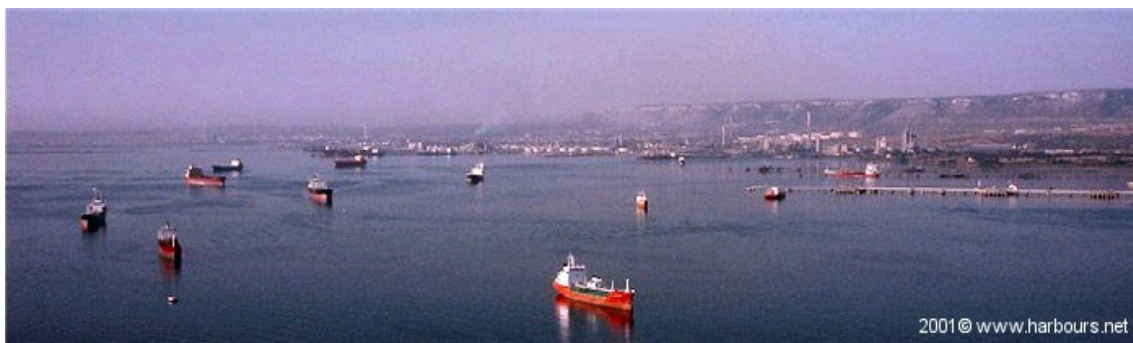
Figure 2: The Augusta Bay

The Augusta Bay is a complex area where heavy industrialization and dense urbanization have promoted a very high state of degradation (Sciacca and Fallico, 1978; De Domenico et al. , 1994). Owing to its nature, a coastal marine environment with a low water turnover. This basin has already been studied for several years because of various