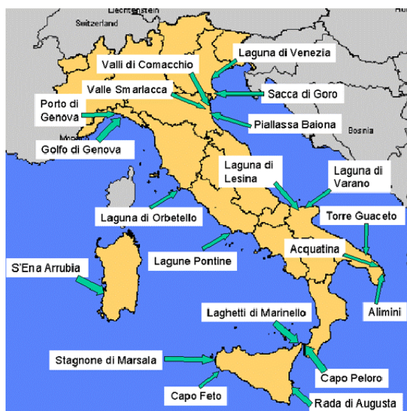
Figure 3: LaguNet sites around the Italian peninsula

The methodology has been applied by LOICZ to approximately 170 coastal environments worldwide; it is based on a mass balance approach and provides important information on the flux of nutrients and ecosystem functions; the approach used is applicable to a majority of coastal ecosystems with data that are normally available from conventional monitoring campaigns. In this way it is possible to compare and to group aquatic systems having different characteristics based on properties related to biogeochemical cycles and to the ecosystem functions that result from these processes.