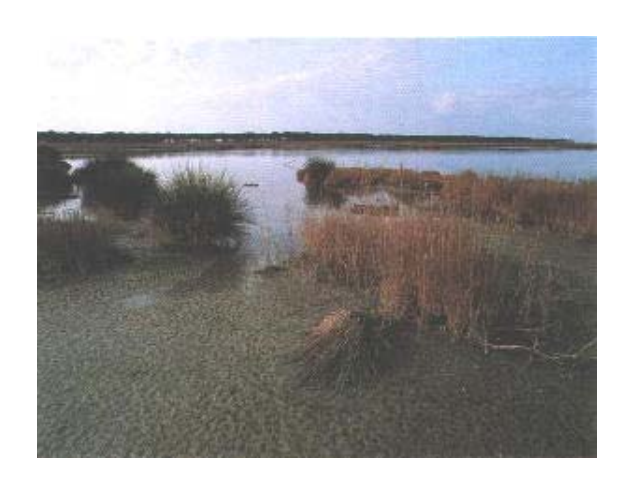
Figure 4: S'Ena Arrubia Lagoon

our research group. In this way it was possible to compare nutrient fluxes and ecosystem functions, showing their evolution after some years.