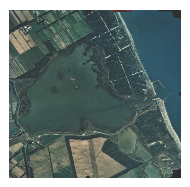
Figure 2: View of S'Ena Arrubia Lagoon

2000). Associations of Thero-Sudetea, Salicornietea fruticosae and Juncetea maritimi classes represent the communities. Phytoplankton component causes intense blooms in spring, especially due to Cyclotella atomus (Husted) and Chlorella sp. The other classes showing relatively high density were Prasinophyceae with Tetraselmis Dinophyceae (Prorocentrum sp., gracile, Prorocentrum micans, Oxyrrhis marina), Euglenophyceae (Euglena sp., Eutreptiella sp.), Cyanophyceae (Anabaena sp., Oscillatoria sp.). Macroalgal component, mostly consisting of Ulva sp. and Enteromorpha flexuosa (Kützing) DeToni, becomes abundant in late spring-summer; but Cladophora albida and Gracilaria verrucosa were also found.