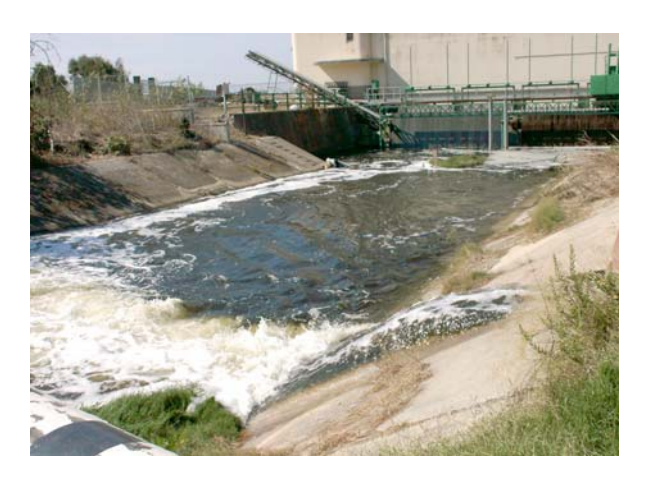
Figure 3: Canale delle acque basse and pumping station

substantially provides most of the freshwater flows into the lagoon. High fluctuations of oxygen are also characteristics, with unexpected variations from over-saturation values to concentrations lower than 50%.